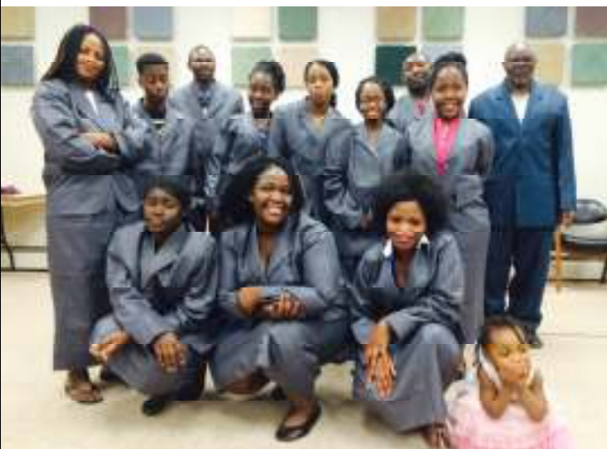
The Prayer Shawl Group celebrated their 10th Anniversary with a night out on Wednesday, January 21.