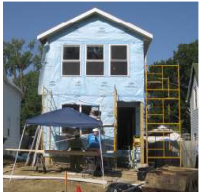
During the third weekend of work