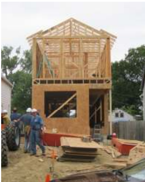
During the second weekend of work