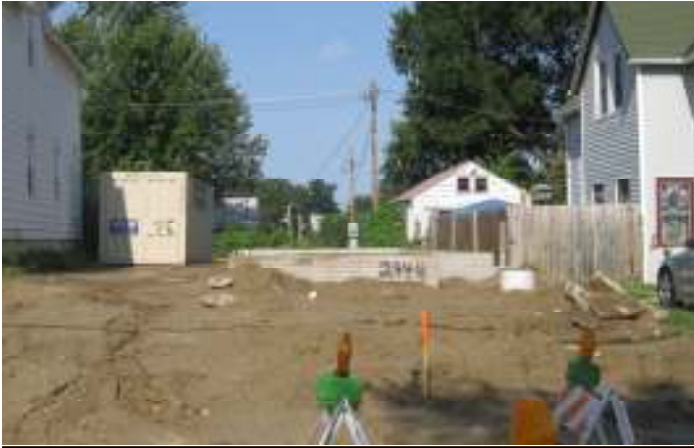
Before the build started