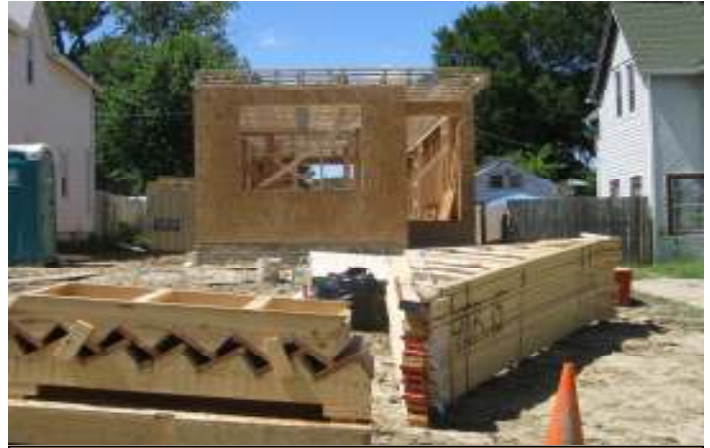
After the first weekend of work