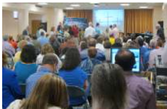
Easter Fusion Service